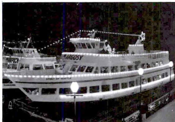
The Argosy Christmas Ship will anchor offshore in front of Des Moines Beach Park and later, Redondo.

Join holiday-spirited folk and enjoy complimentary cookies, hot cider, and cocoa on Saturday, December 8, 6:30-9:30 p.m. The Argosy Christmas Ship will anchor offshore in front of Des Moines Beach Park while the Bellevue Chamber Chorus performs holiday songs from 7:10-10 p.m.