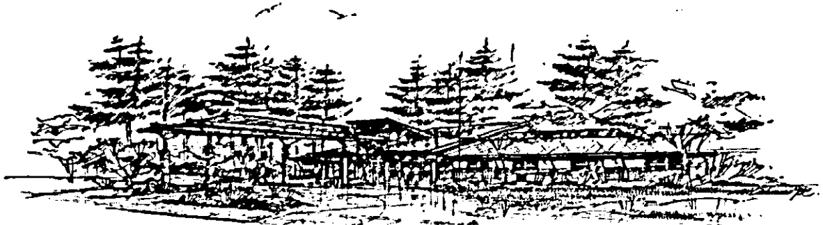
(Des Moines Community Center Conceptual Artist Rendering)

The City of Des Moines is planning a new multi-purpose, multi-generational Community Center to be located on five acres of city land on 24 th Avenue South overlooking Puget Sound. Initial plans call for development of a "core" facility for senior services and general recreation programs. Your input is critical in designing a facility to meet the needs of all segments of our community.